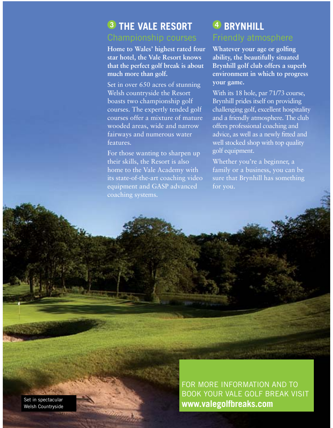
Set in spectacular Welsh Countryside

Whether you're a beginner, a family or a business, you can be sure that Brynhill has something for you.